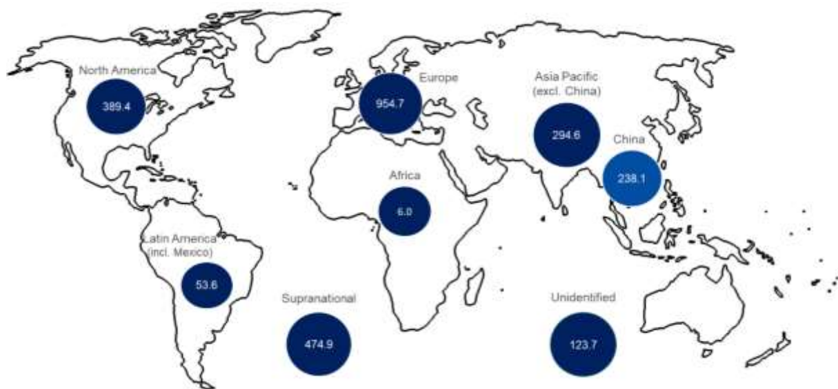
Figure 3 Cumulative GSS bond issuance (USD bn). Period: 2007 – Q3 2021 by region