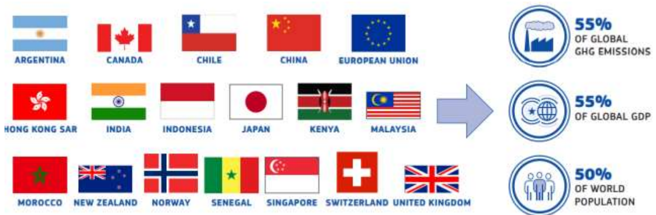
Figure 1 IPSF Member Jurisdictions

During 2021, the membership of the IPSF kept growing. Hong Kong Special Administrative Region of China, Japan and United Kingdom joined last year, with the latest addition being Malaysia 2 . The IPSF includes now 18 member jurisdictions.